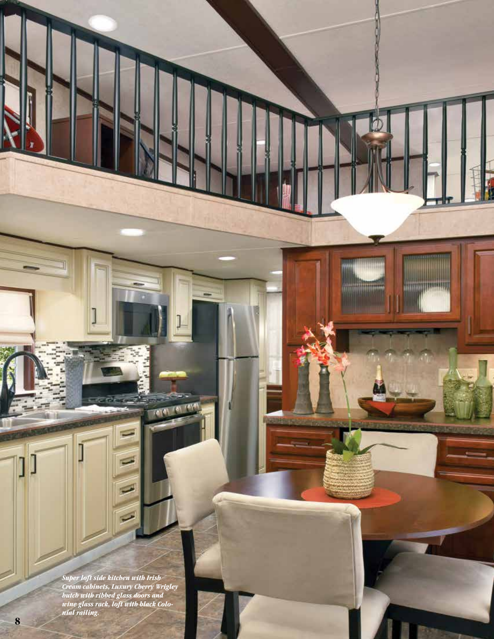
Super loft side kitchen with Irish Cream cabinets, Luxury Cherry Wrigley butch with ribbed glass doors and wine glass rack, loft with black Colonial railing.