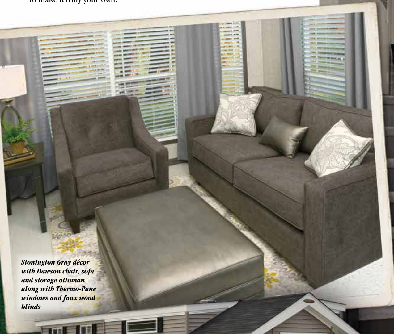
Stonington Gray décor with Dawson chair, sofa and storage ottoman along with Thermo-Pane windows and faux wood blinds

For a small cottage with big appeal, a Timber Ridge offers architectural interest, high-end appointments and all the comforts you want in your blissful hideaway. Choose from a variety of floor plans and standard features, then select options to make it truly your own.