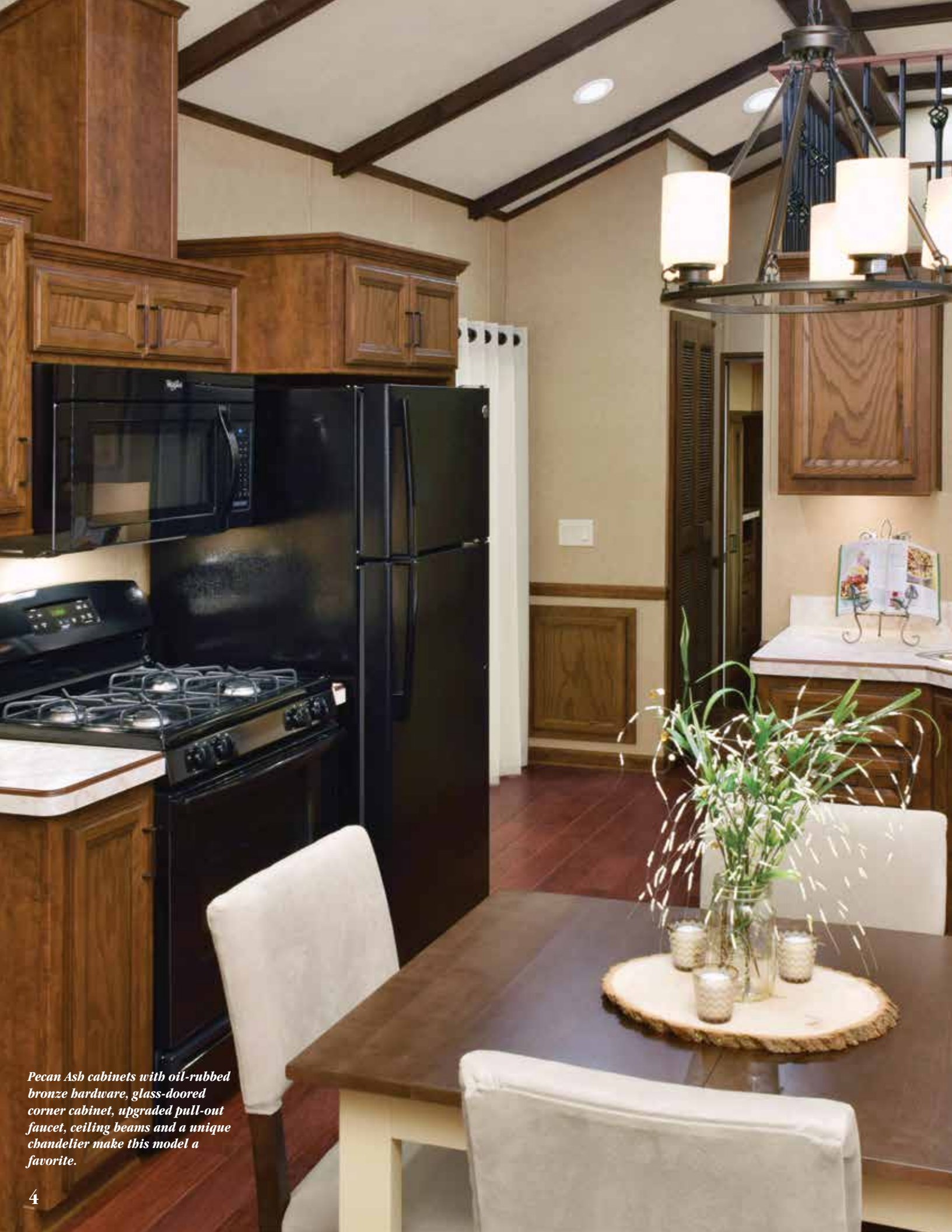
Pecan Ash cabinets with oil-rubbed bronze hardware, glass-doored corner cabinet, upgraded pull-out faucet, ceiling beams and a unique chandelier make this model a favorite.