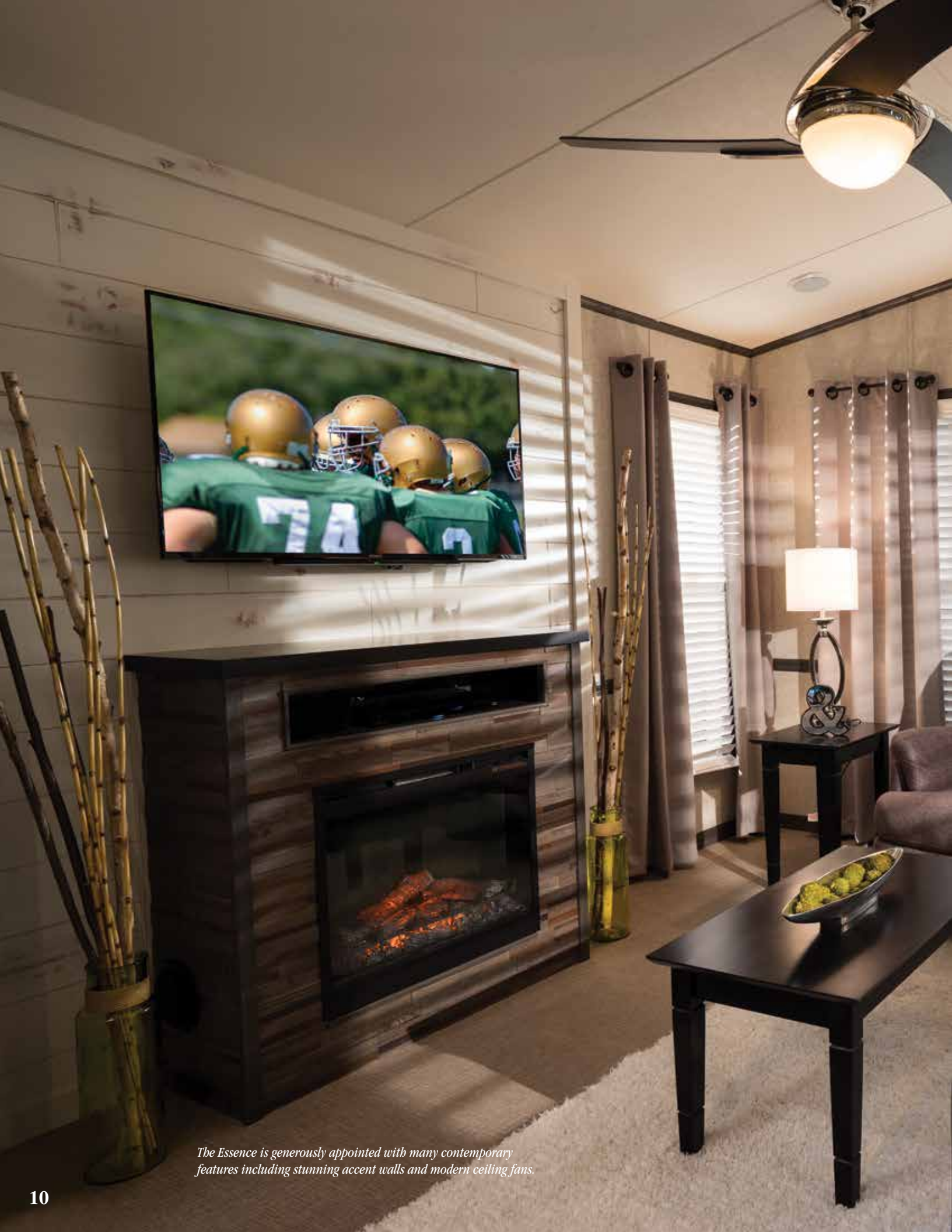
The Essence is generously appointed with many contemporary features including stunning accent walls and modern ceiling fans.