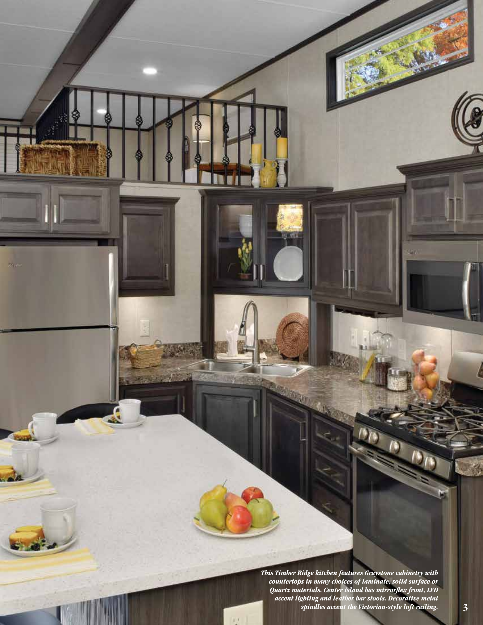
This Timber Ridge kitchen features Graystone cabinetry with countertops in many choices of laminate, solid surface or Quartz materials. Center island has mirrorflex front, LED accent lighting and leather bar stools. Decorative metal spindles accent the Victorian-style loft railing.