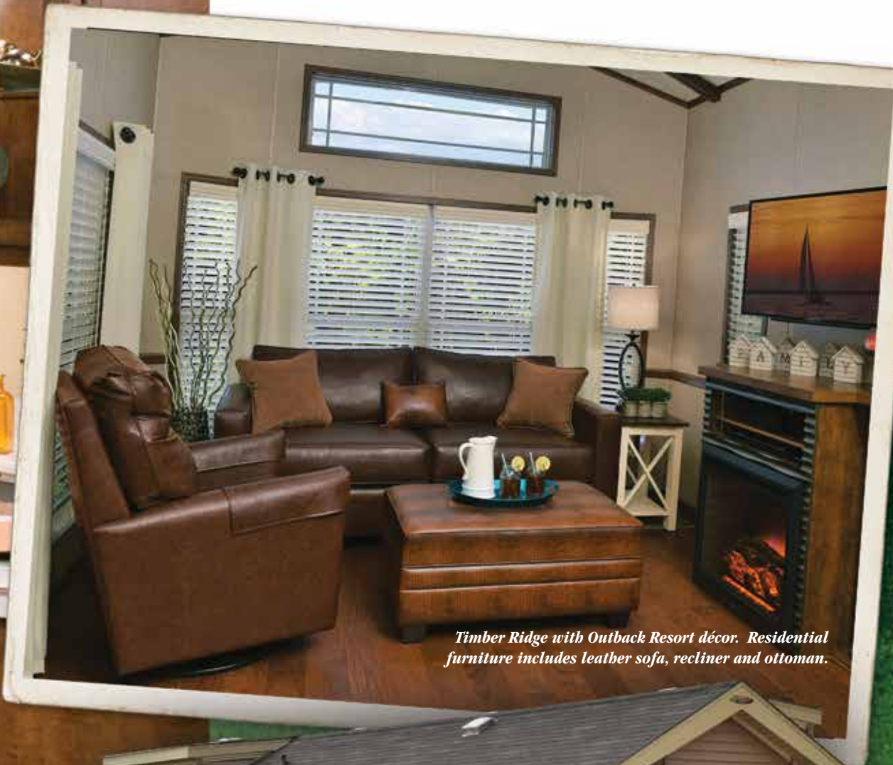
Timber Ridge with Outback Resort décor. Residential furniture includes leather sofa, recliner and ottoman.

You'll appreciate the many decorative touches that will reflect your style preferences from coastal themes to casual to contemporary or formal. Timber Ridge is truly your retreat done your way.