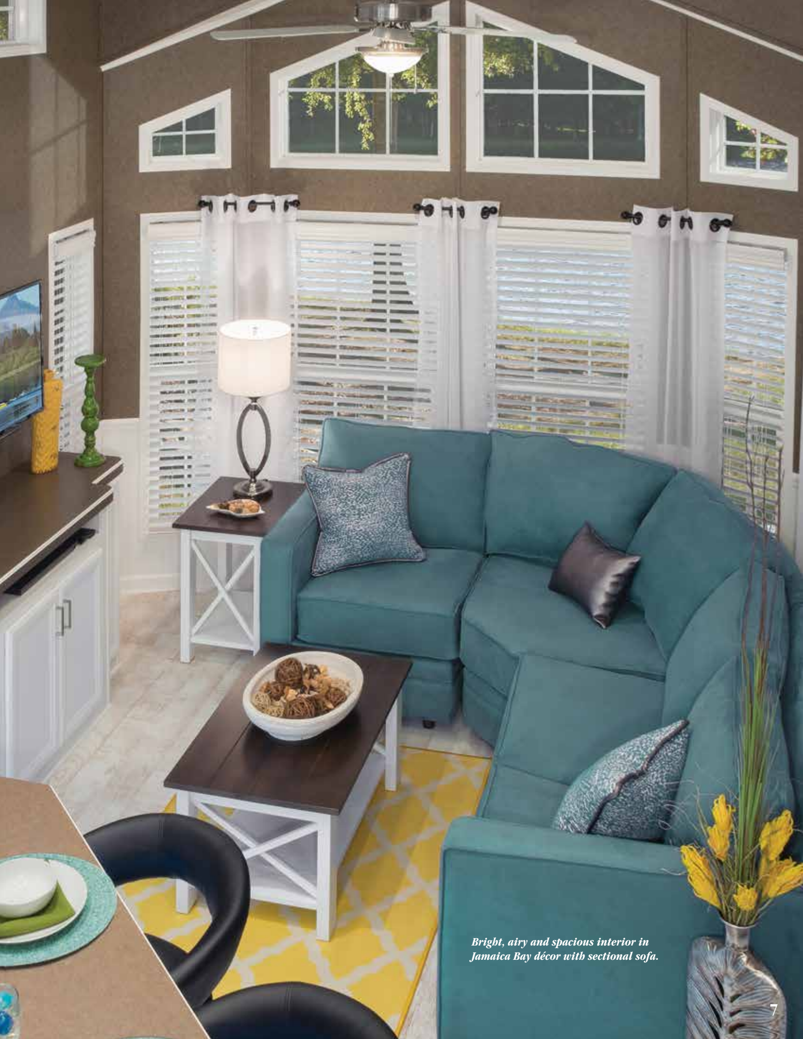
Bright, airy and spacious interior in Jamaica Bay décor with sectional sofa.