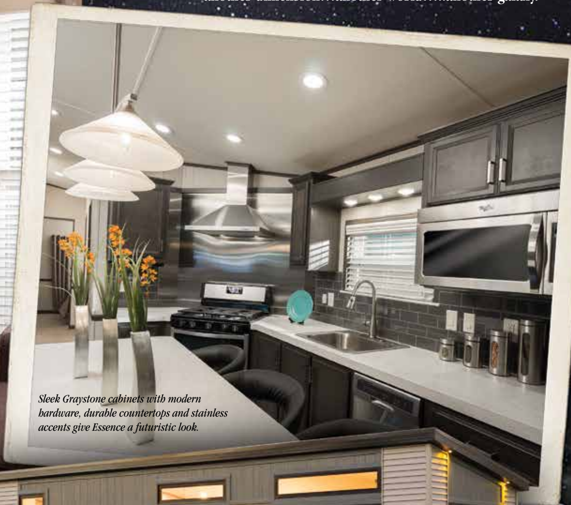
Sleek Graystone cabinets with modern hardware, durable countertops and stainless accents give Essence a futuristic look.

The newly designed Essence combines Woodland Park's unmatched, quality workmanship with New Age, futuristic themes. This park model was specifically designed for individuals with the most discriminating tastes. From the moment you approach your Essence park model and observe the sleek, modern exterior to the second you walk into the get-a-way of which you could only dream, you have truly entered another dimension...another world.....another galaxy.