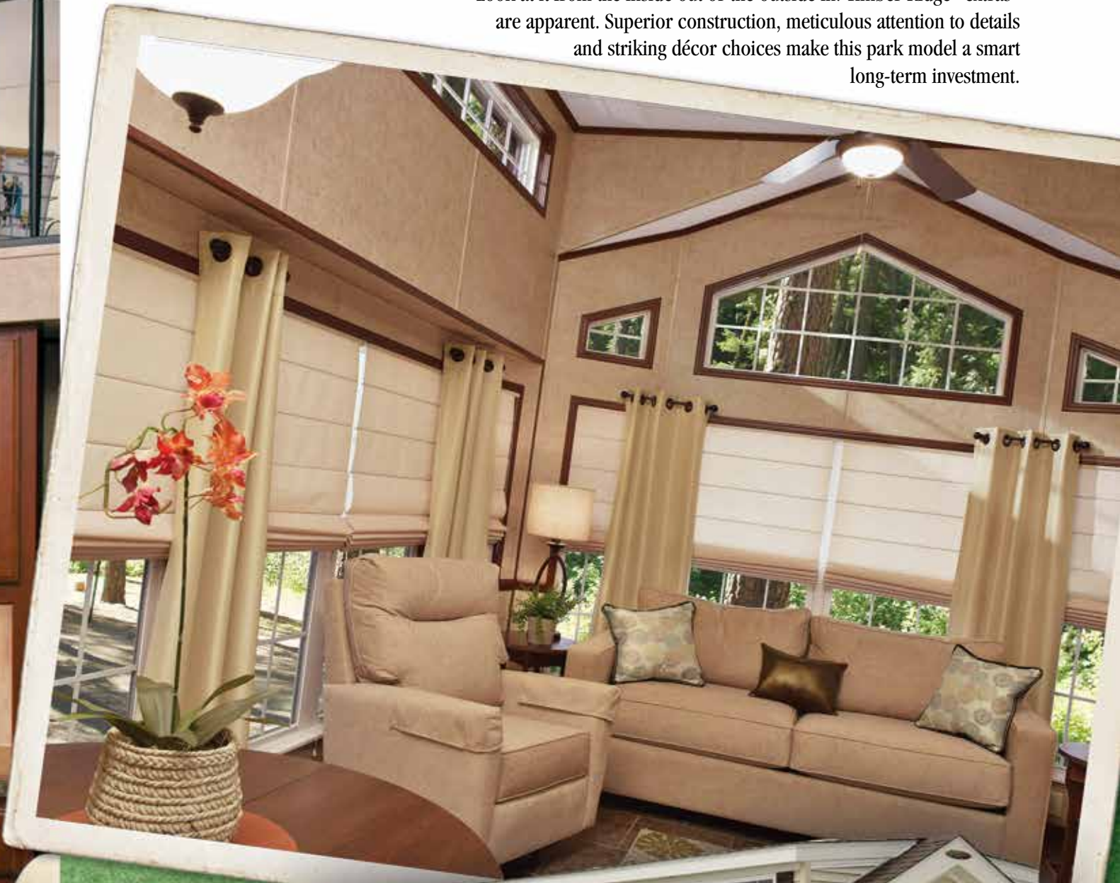
Ivory Coast décor with sofa, recliner, Roman shades on all windows, and PVC floor tile in Limestone Chestnut.

Look at it from the inside out or the outside in. Timber Ridge “extras” are apparent. Superior construction, meticulous attention to details and striking décor choices make this park model a smart long-term investment.