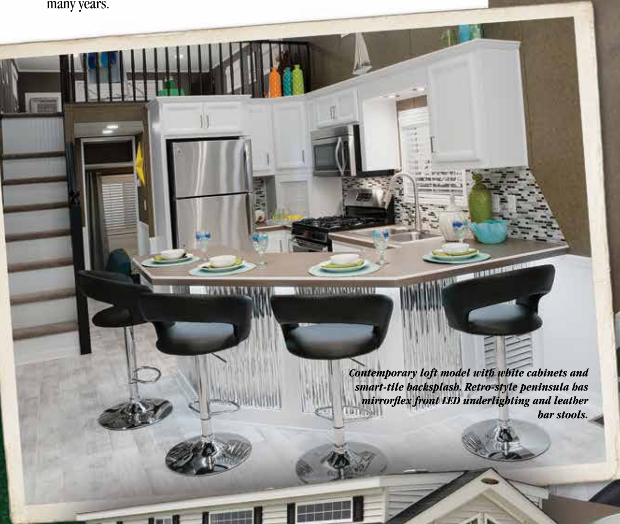
Contemporary loft model with white cabinets and smart-tile backsplash. Retro-style peninsula has mirrorflex front LED underlighting and leather bar stools.

Woodland Park's obsession for quality permeates everything we do. Quality materials combined with unprecedented fit and finish produce pleasing aesthetics and solid workmanship that can be enjoyed for many, many years.